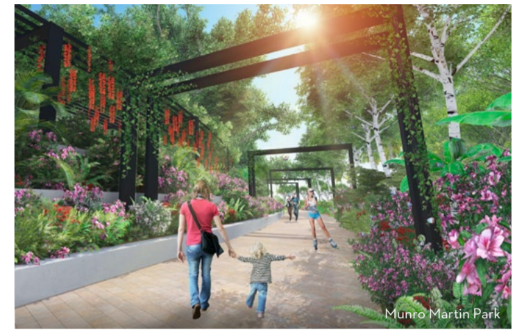
Munro Martin Park