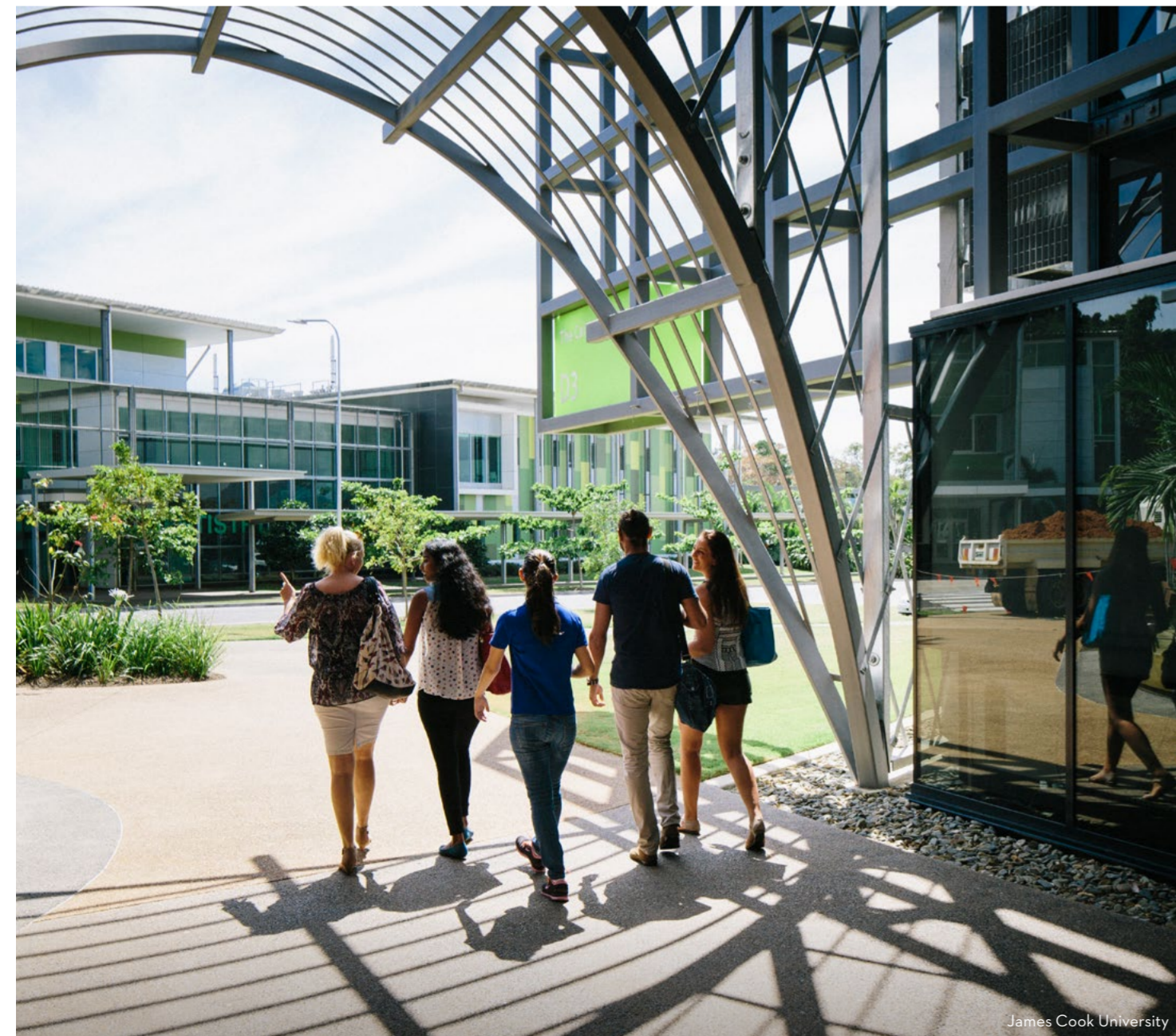
James Cook University