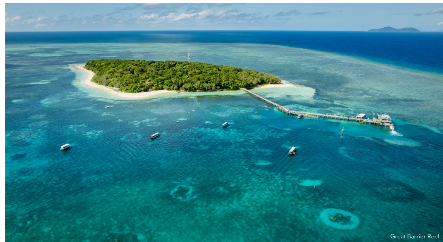
Great Barrier Reef

SURROUNDED BY RAINFORESTS, beaches and coral reefs, Cairns is home to two UNESCO World Heritage sites, the Great Barrier Reef and Daintree Rainforest.