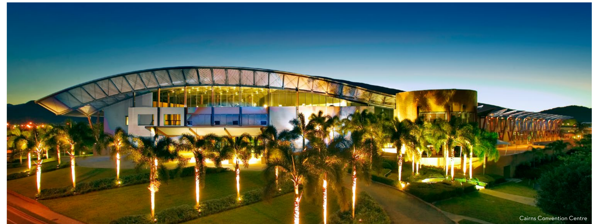
Cairns Convention Centre