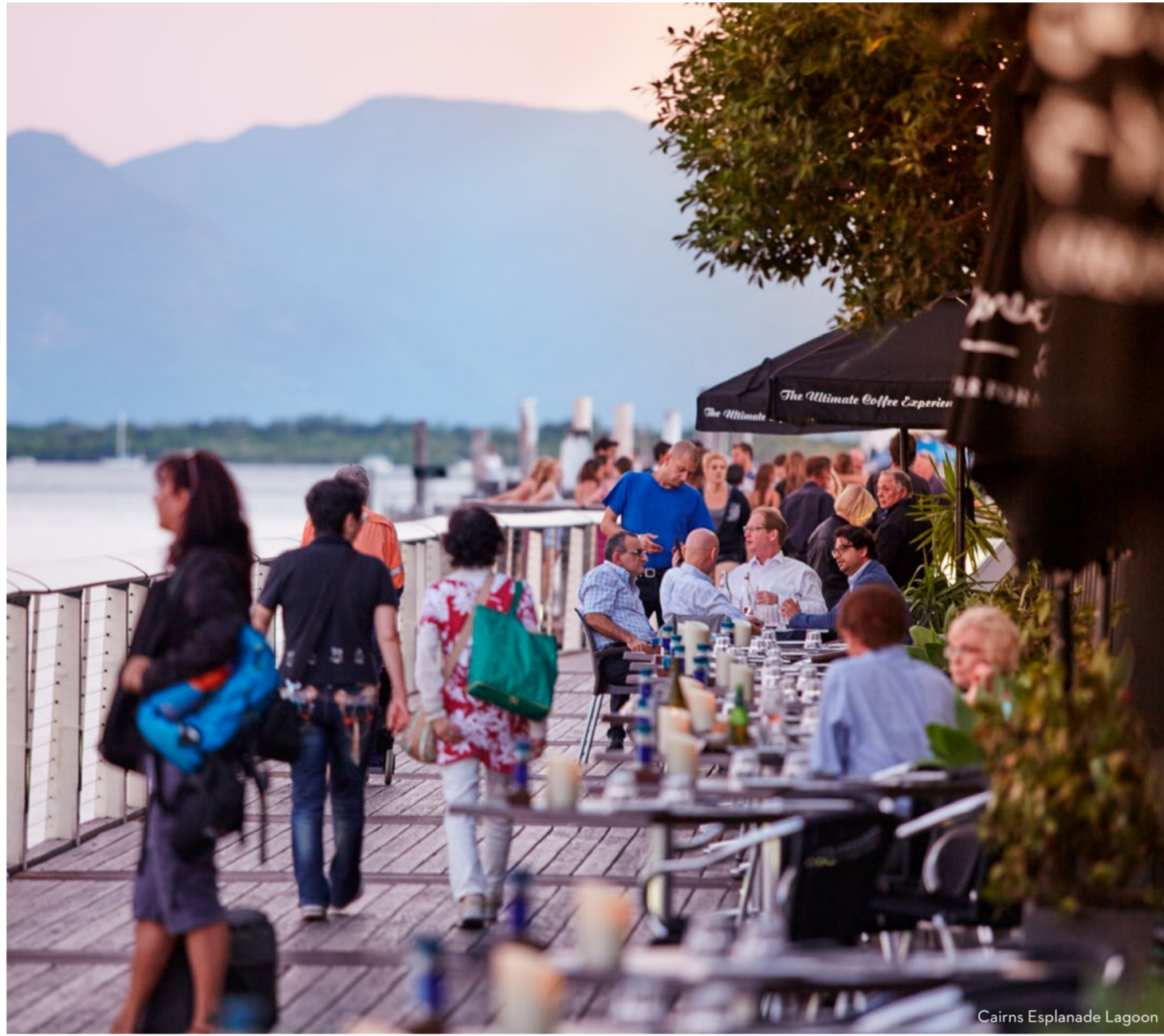
Cairns Esplanade Lagoon

Possibilities are aplenty. Positioned right opposite Cairns Central Shopping Centre, Nova City will be the home to a vibrant eat street, local enterprises and international retail brands.