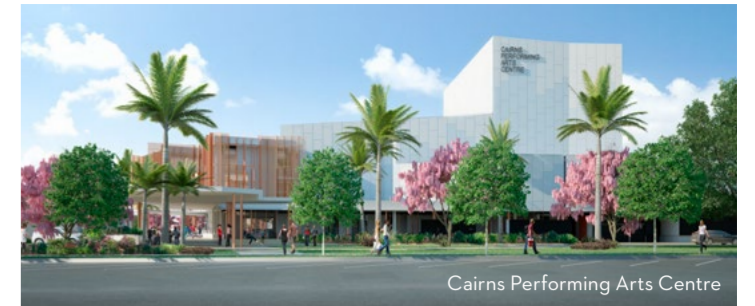
Cairns Performing Arts Centre

A new Cairns Performing Arts Centre (CPAC) and lush tropical parklands are coming soon to The Precinct. Featuring an outdoor entertainment space, the Munro Martin Park will provide a verdant backdrop to the CPAC and a dramatic entry statement to the city.